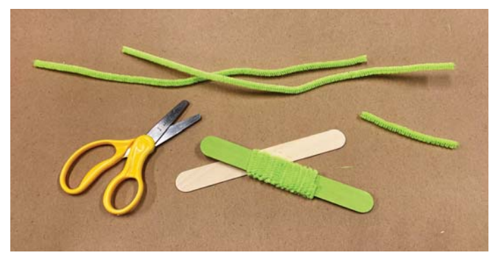
2. Let the paint dry. Use two green pipe cleaners to wrap the middle of the craft stick. Cut off the excess pipe cleaners.