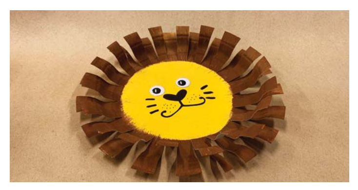
5. Bend the strips to create variety in the mane.