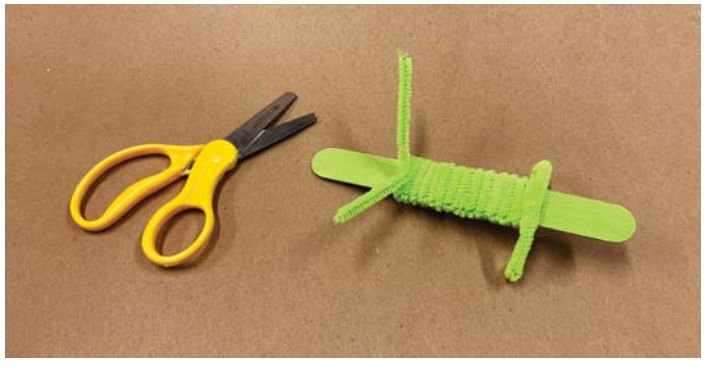
3. Use more green pipe cleaners to create the legs. Cut them to an appropriate length.