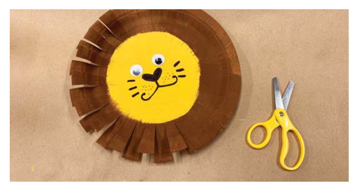
4. Cut the brown edge into 1/2 inch strips to create the effect of a mane.