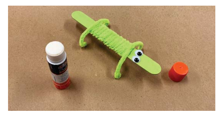
4. Glue googly eyes to one side of the craft stick to create the face.