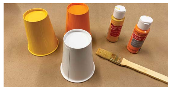
1. Paint the paper cup in the color of the animal you're crafting.