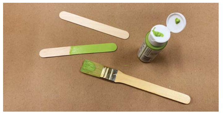
1. Use large craft sticks and paint them with non-toxic green acrylic paint.