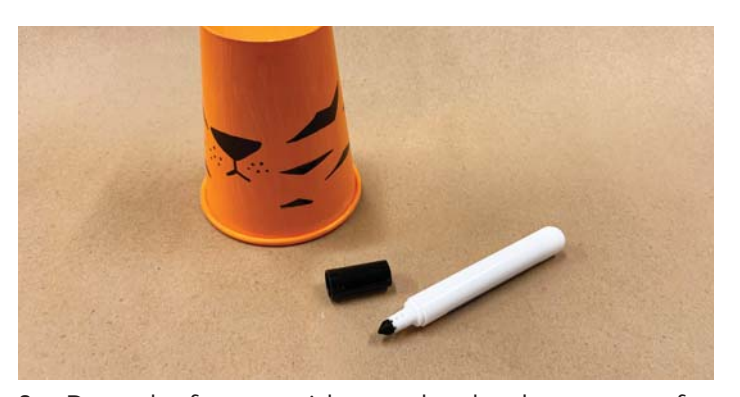
2. Draw the face on with a marker, but leave space for the eyes.