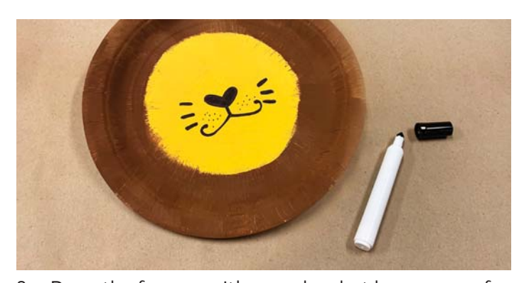
2. Draw the face on with a marker, but leave space for the eyes.