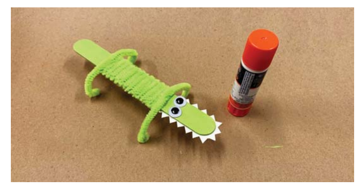
6. Glue the shape that you cut out to the bottom of the face.