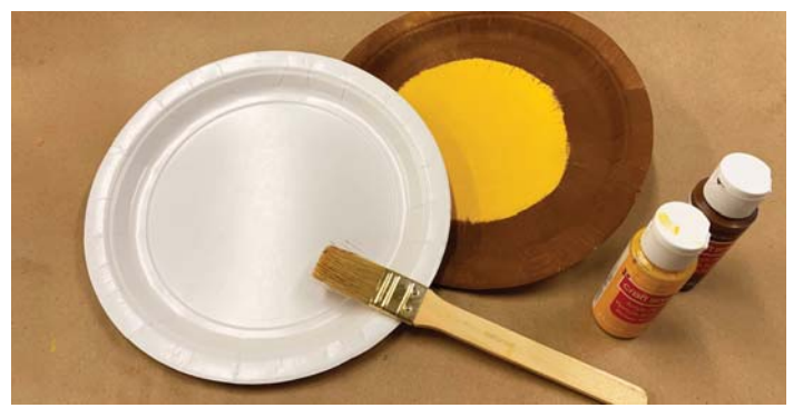
1. Paint the middle of the plate yellow and the edge of the plate brown.