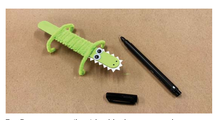
7. Draw on nostrils with a black pen or marker.