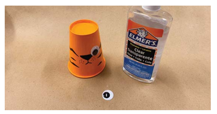
3. Glue on googly eyes.