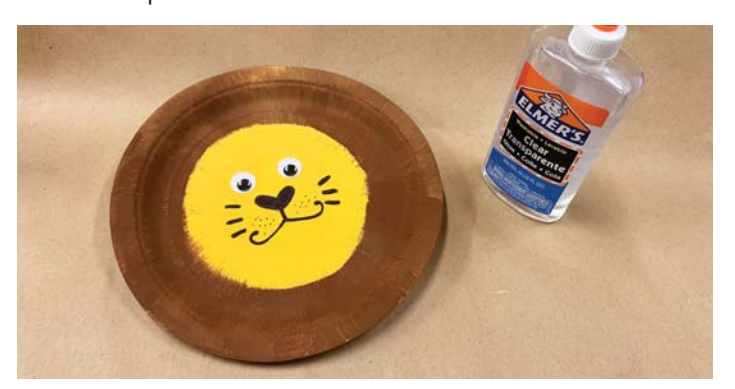
3. Glue on googly eyes.