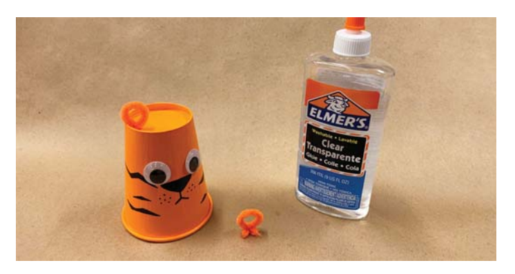
5. Bend the bottom of the ear and glue the pipe cleaners to the top of the paper cup.