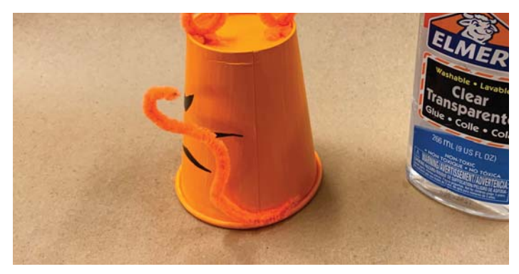
6. Take a longer piece of pipe cleaner and use it as a tail. Glue it to the back of the cup.