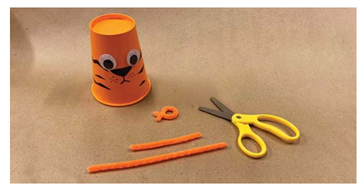
4. Use pipe cleaners to create the shape of ears.